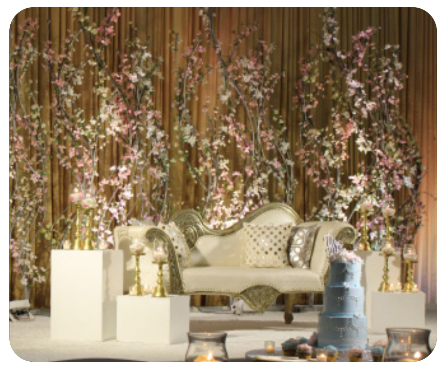
Prices subject to change without notice. Service Fee of 20% plus 9.75% sales tax and 8.75% liquor tax.